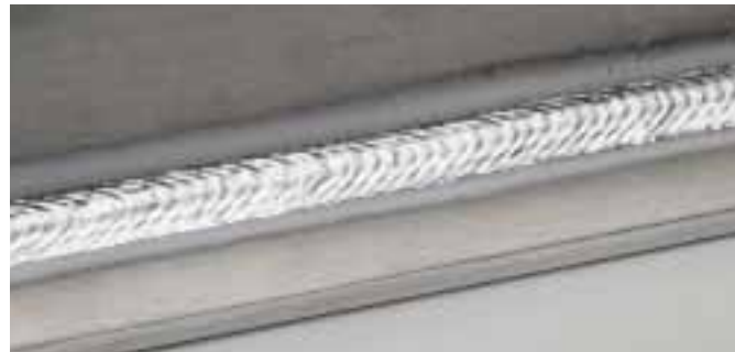
Modulation Frequency 0

Improved Bead Appearance with Pulse and Pulse-On-Pulse® Waveforms Offer the Ability to Widen the Modulation Frequency Range to Space Out the Ripples