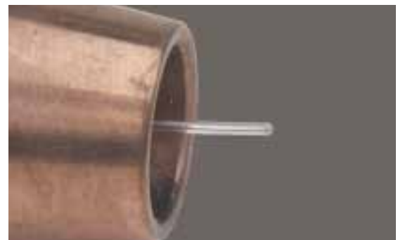
Consistently Rounded Wire End, Perfect for Starting