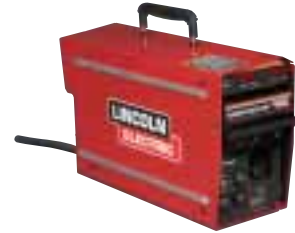
Power Feed™ 25M