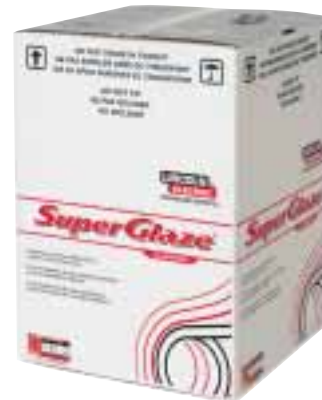
Super Glaze® 300 lb. Box