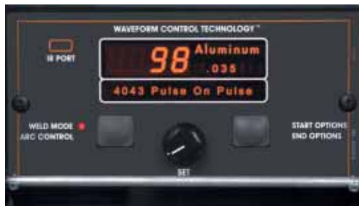
Power Feed™ 10M Mode Select Panel (MSP4)

Alternatively, for thin aluminum, it is recommended to set the start WFS approximately 100 in./min. (254 cm/min.) lower than the welding WFS. It will ramp up to the welding WFS over the start time (0.5 – 1.0 seconds is recommended) and give a smooth start with little or no build-up at the weld start.