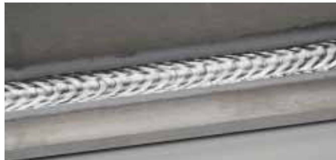
Modulation Frequency -10