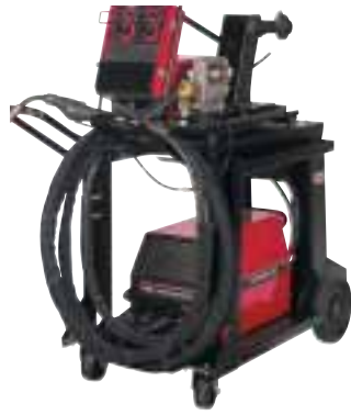
Power Wave® 355M/ Power Feed™ 10M Ready-Pak®