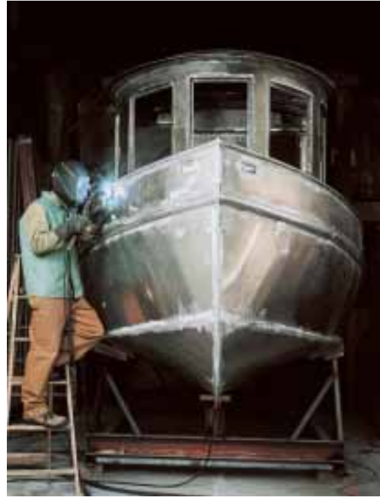
Aluminum Tug Boat Fabrication

With the Power Wave® and Power MIG® digital platform, there is control over twenty welding variables in pulsed GMAW waveforms. By carefully controlling these variables in the development of waveforms, the engineers at Lincoln Electric® can vary the welding behavior and optimize the output for an optimum weld. With these fine tuning adjustments the aluminum waveforms have been modified to drastically reduce very fine spatter that is often characteristic of aluminum spray GMAW. In addition, the nominal arc length was made more robust to prevent dark, sooty welds.