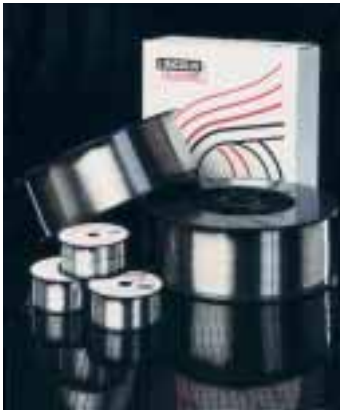
Super Glaze® 1 lb. & 16 lb. spools

Super Glaze® aluminum consumables deliver consistent wire composition, smooth feeding, and a stable arc.