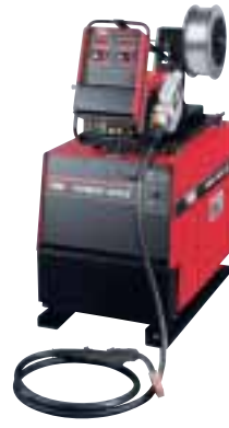
Power Wave® 455M/ Power Feed™ 10M