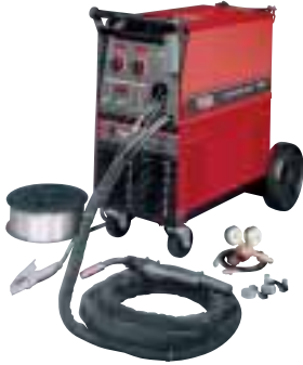
Power MIG® 350MP Push-Pull One-Pak®

TOTAL s2f™ Systems for MIG welding aluminum provide the best equipment for light and industrial aluminum welding needs.