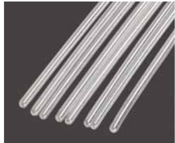
Aluminum Wire Ends, Same Shape and Size

Lincoln Electric® has found a solution to the problem. When the operator takes his finger off the gun trigger, the power supply will make one ending pulse and extinguish the arc at the end of the pulse. The arc is extinguished at the same point in the pulse cycle every time. This means that the wire end always has the same shape and size. The TOTAL s2f™ welding process transfers that last droplet, and then shuts off after the conditioning pulse, so the wire tip is conditioned. There is no large glob or ball at the end of the wire, just a consistently rounded end, perfect for starting. The result is great starting every time.